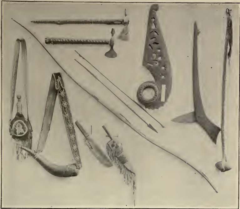
INDIAN WAR IMPLEMENTS.